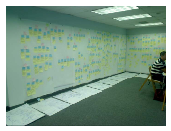
Figure 2: Affinity Diagram

Proceedings of the Second International Conference on Automotive User Interfaces and Interactive Vehicular Applications (AutomotiveUI 2010), November 11-12, 2010, Pittsburgh, Pennsylvania, USA