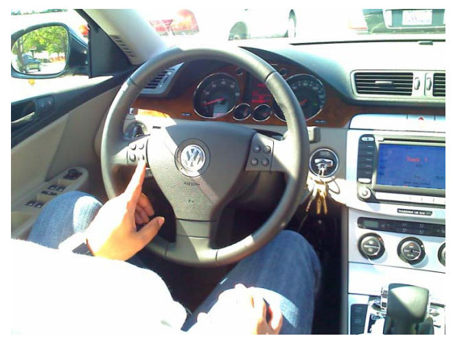
Figure 1: Contextual Inquiry

At the end of data collection, the team had over 2500 notes from the 30 interpretation sessions. These notes were all arranged into a single, final affinity diagram that covered approximately 250 square feet of wall space (see Figure 2). The consolidated sequence model describing all the relevant tasks in step-by-step detail was over 35 feet long (see Figure 3). The consolidated artifact model captured, in detail, how drivers used the interior spaces of their vehicles, often in ways not originally designed for (see Figure 4).