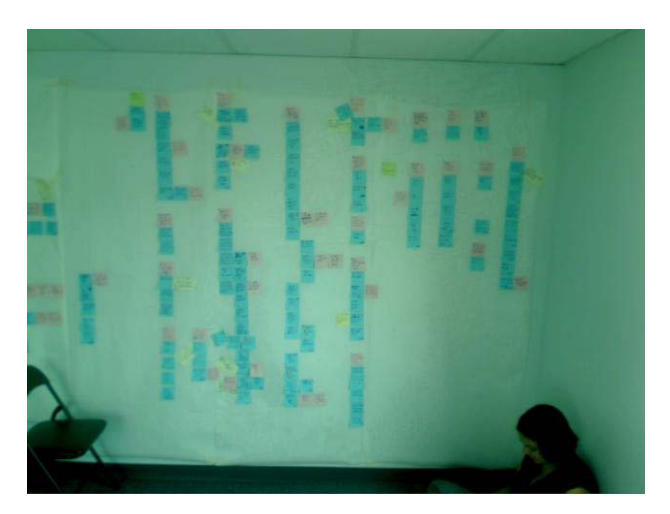
Figure 3: Consolidated Sequence Model